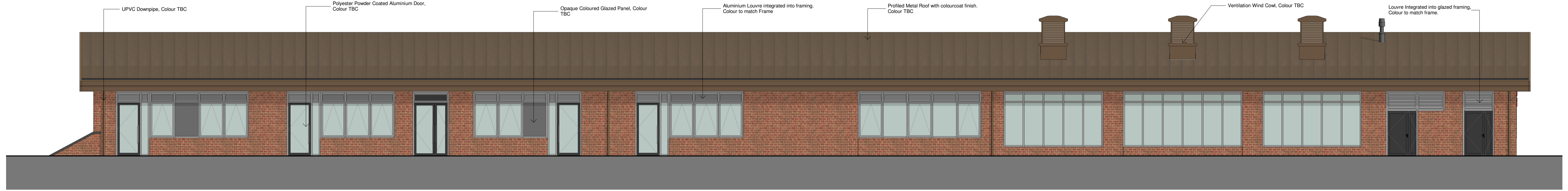
Proposed East Elevation 1 : 100