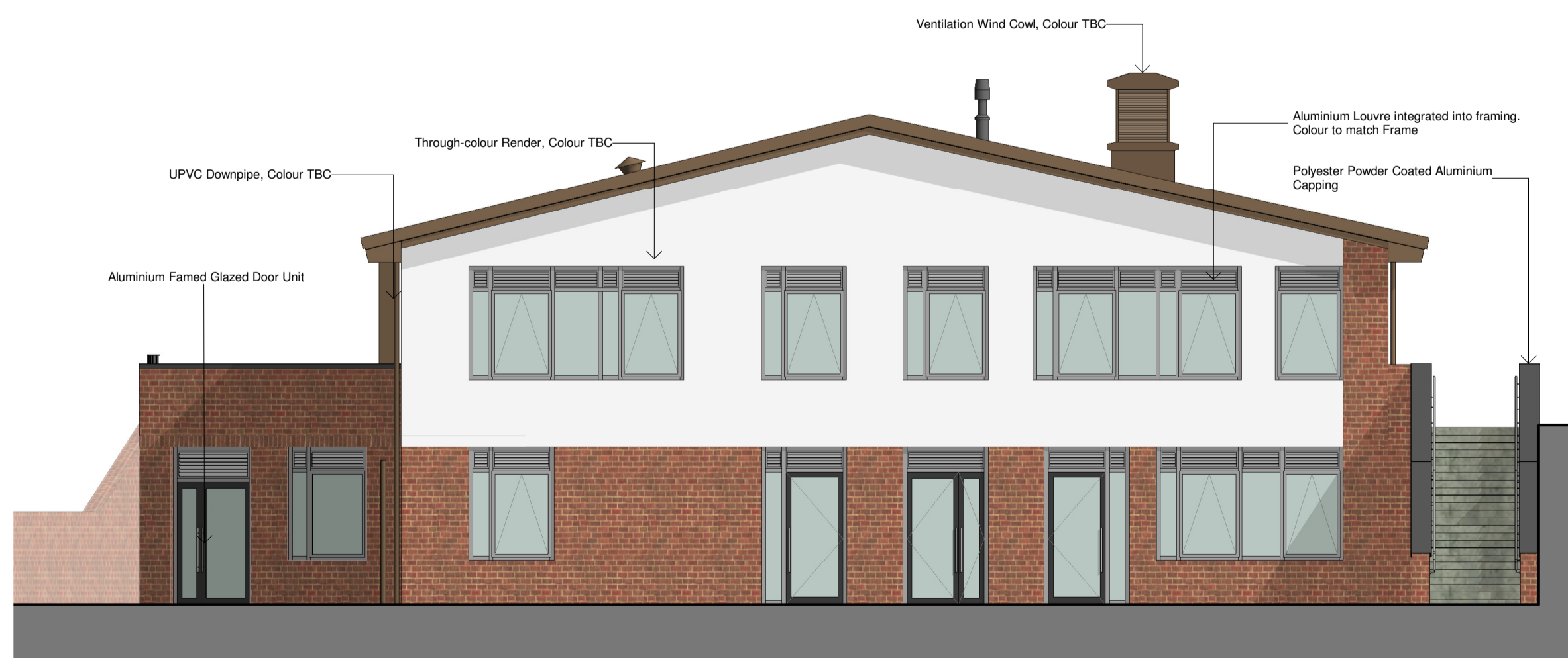
Proposed South Elevation 1 : 100