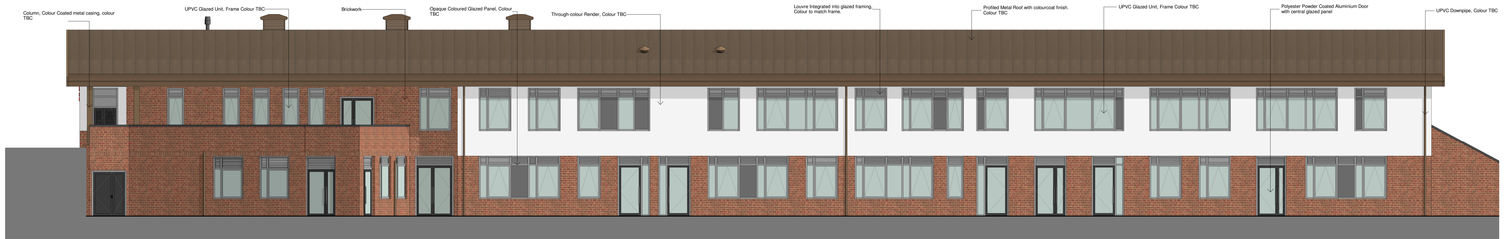
Proposed West Elevation 1 : 100